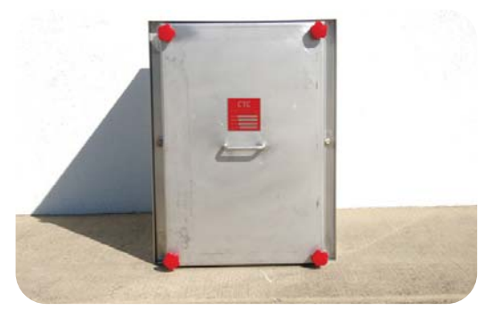
B1-11 BASE UNIT